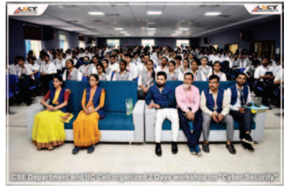
CSE Department and IIC Cell organized 2 Days workshop on “Cyber Security”