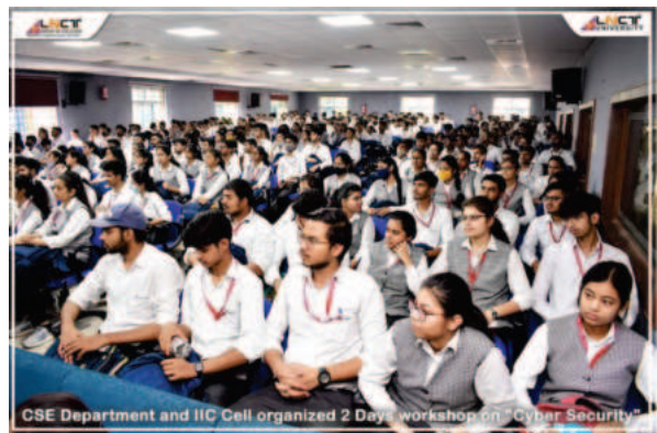
CSE Department and IIC Cell organized 2 Days workshop on “Cyber Security”