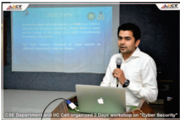
CSE Department and IIC Cell organized 2 Days workshop on “Cyber Security”