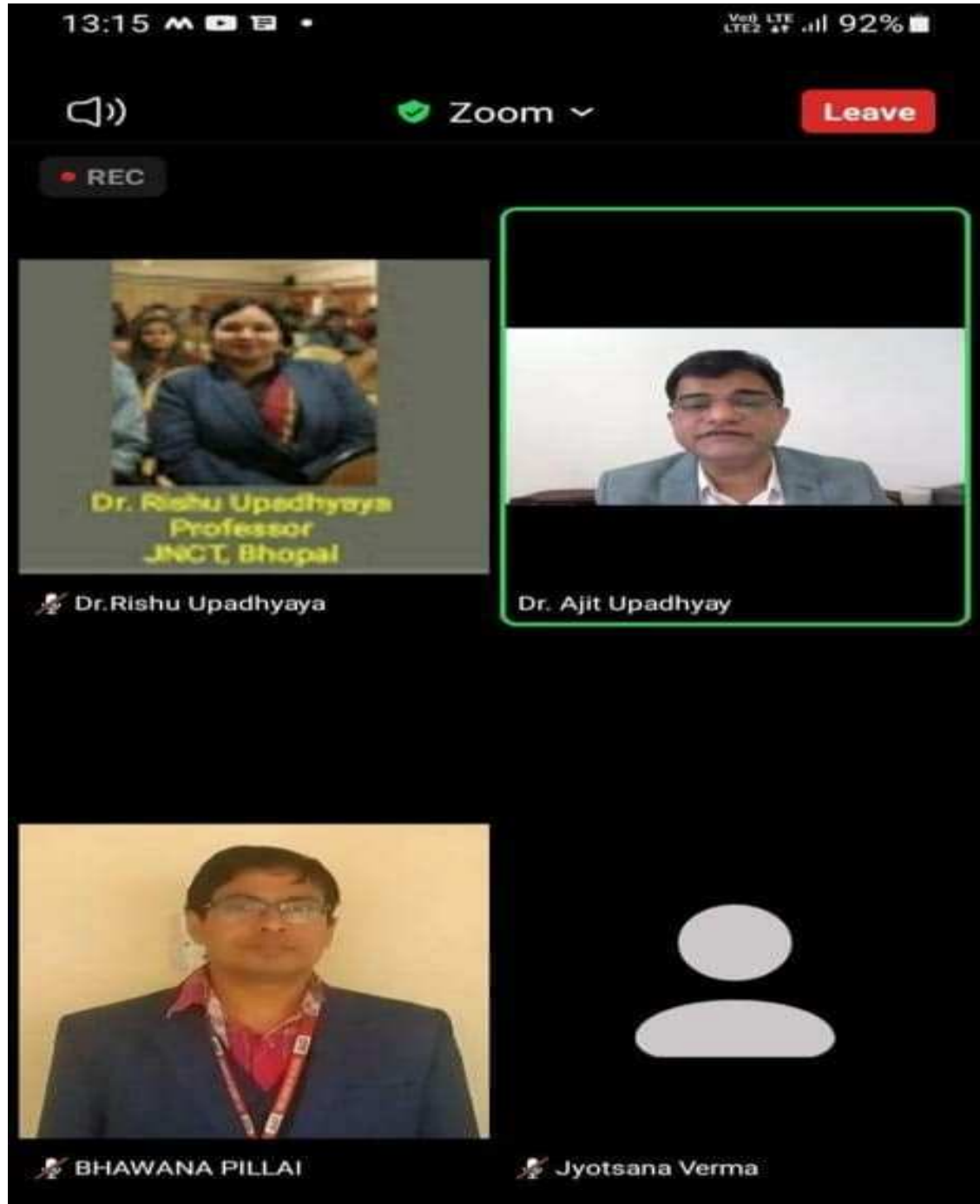
Expert addressing the students