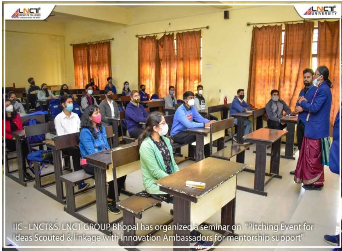
IIC - LNCT&S, LNCT GROUP Bhopal has organized a seminar on "Pitching Event for Ideas Scouted & linkage with Innovation Ambassadors for mentorship support"