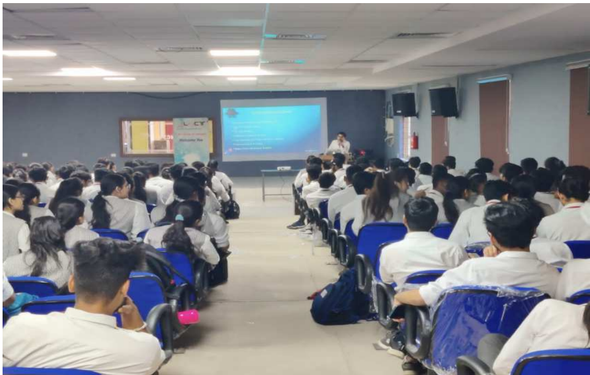
Students attending the prog