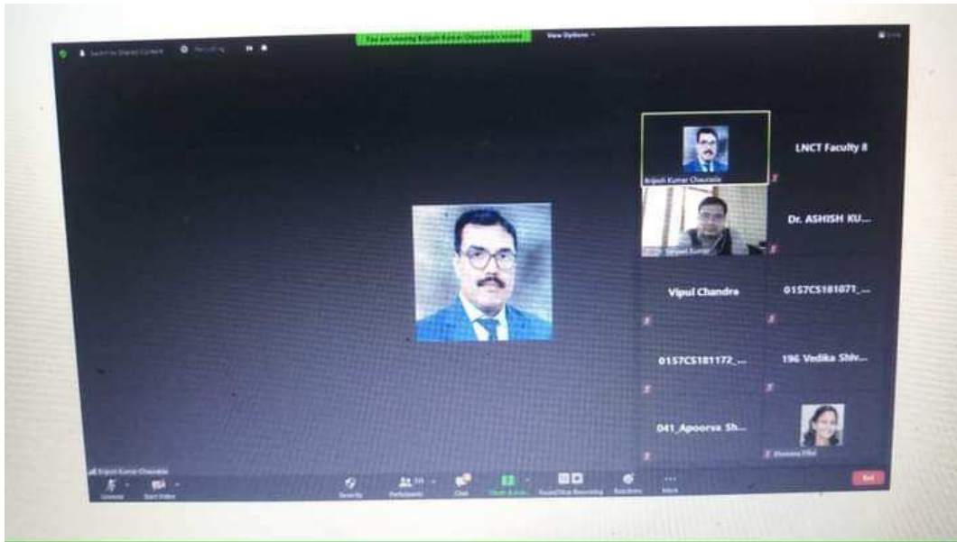
Students attending the event