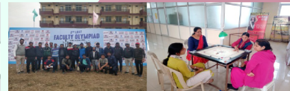
LNCT Faculty Olympiad, 2021.

Successful Start-Up Founders Live Session on "Remotely control your PC with your phone" – 16 th January, 2021.